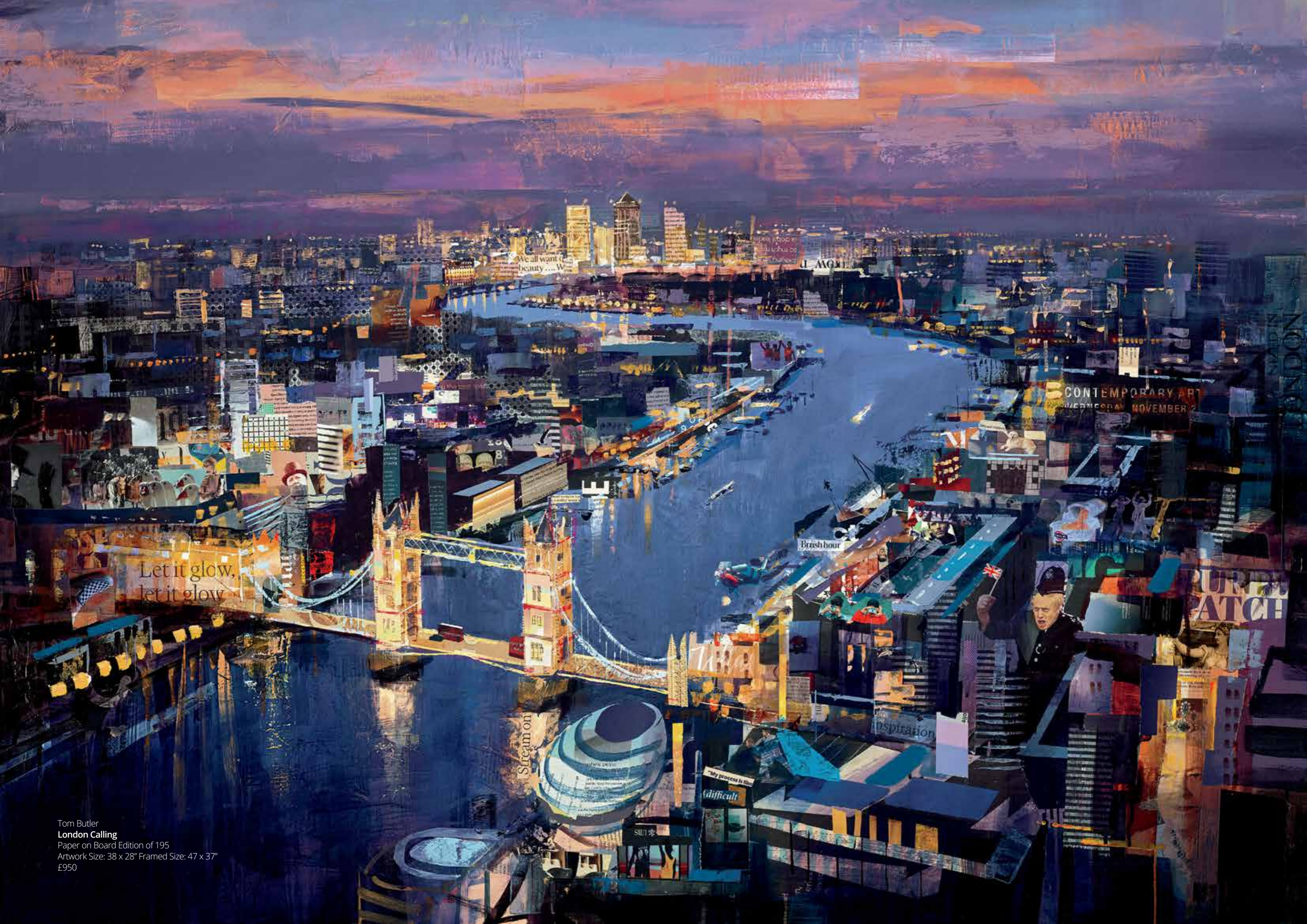
Tom Butler London Calling Paper on Board Edition of 195 Artwork Size: 38 x 28" Framed Size: 47 x 37" £950