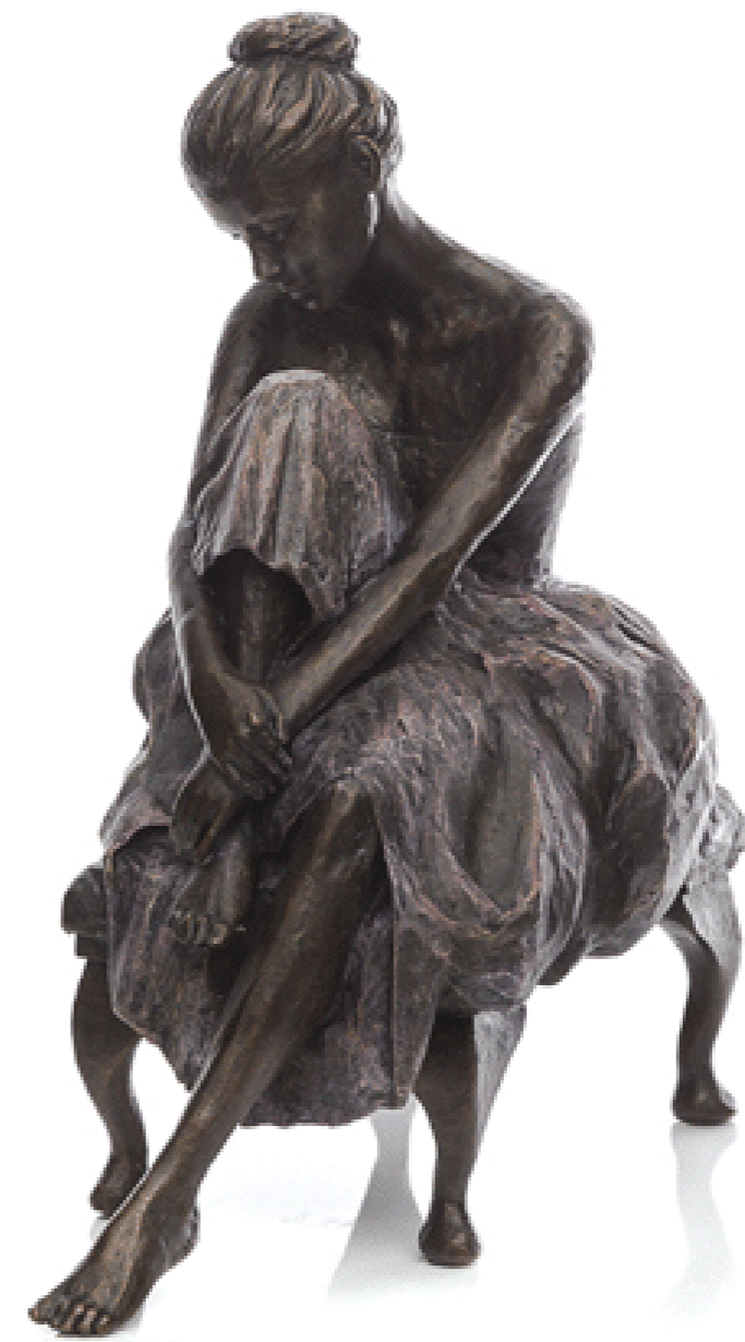
Sherree Valentine-Daines In Repose Bronze Sculpture Edition of 195 Sculpture Size: 8 x 10 x 4" £895