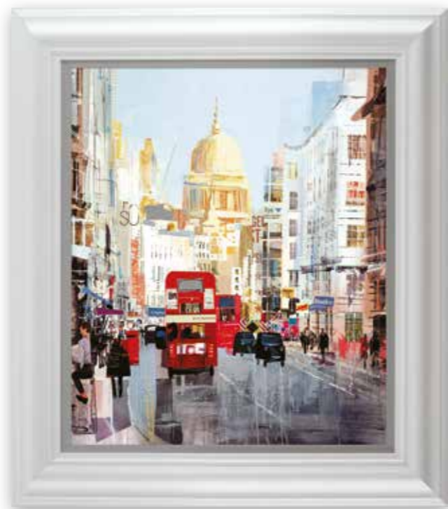
Tom Butler Like Clockwork Paper on Board Edition of 195 Artwork Size: 15 x 18" Framed Size: 27 x 27" £450