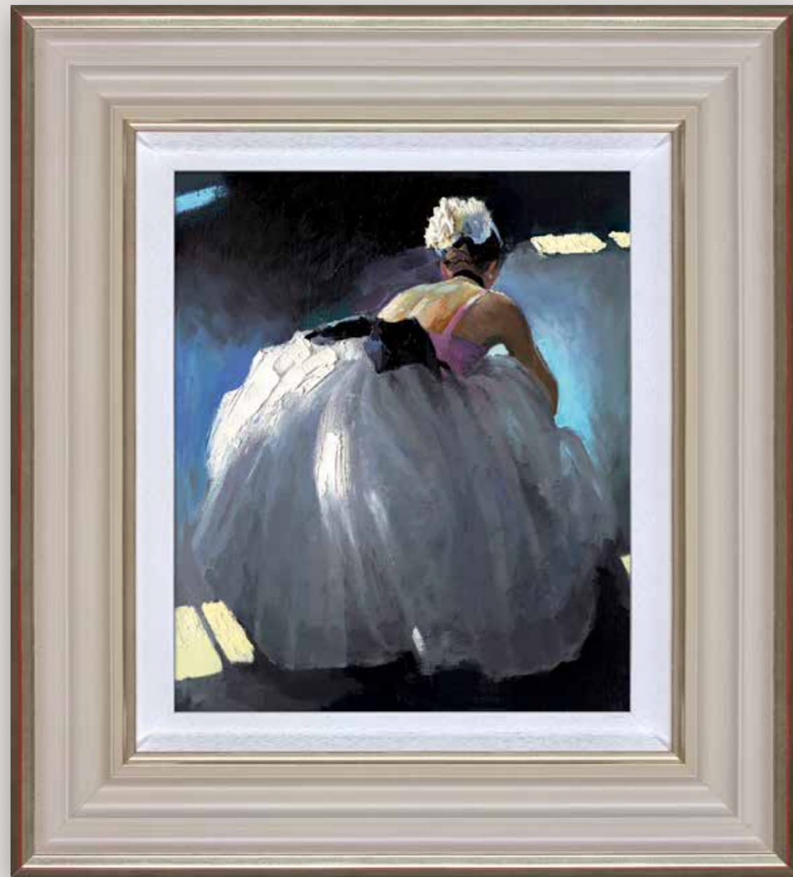
Sherree Valentine-Daines Tranquil Beauty Box Canvas Edition of 195 Artwork Size: 9 x 11" Framed Size: 18 x 20" £395