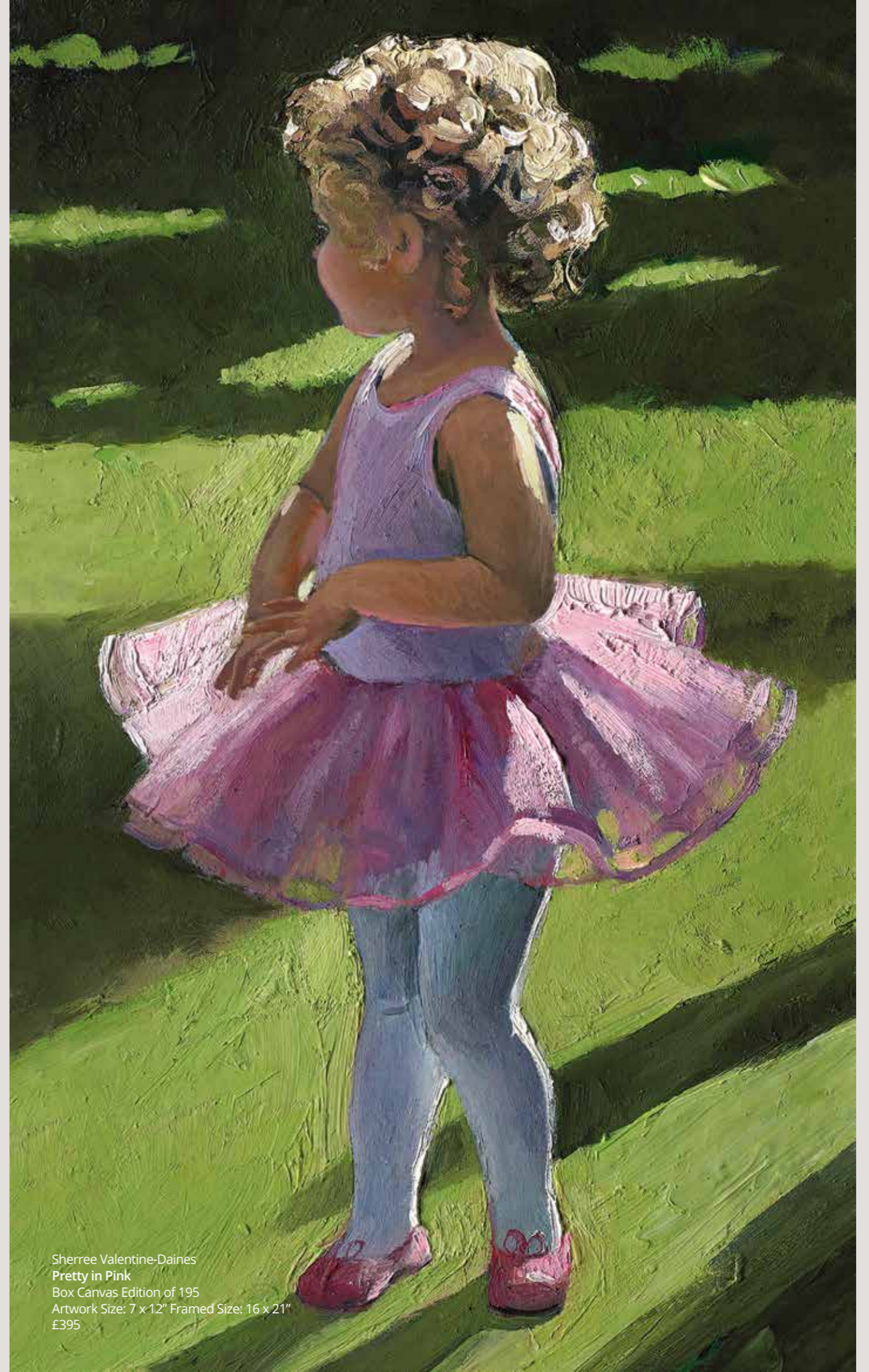
Sherree Valentine-Daines Pretty in Pink Box Canvas Edition of 195 Artwork Size: 7 x 12" Framed Size: 16 x 21" £395