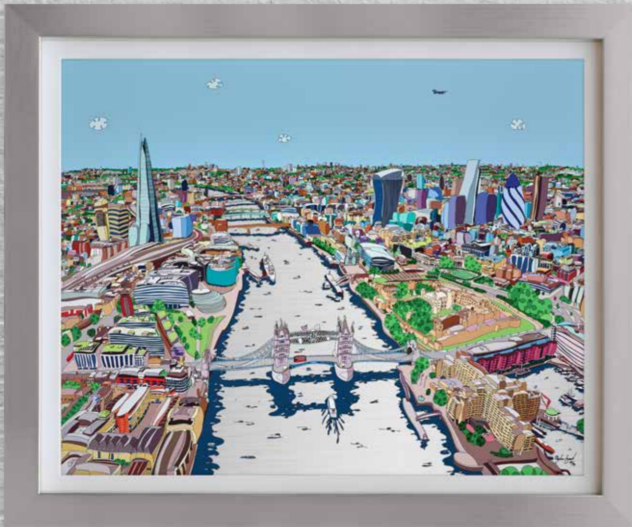
Dylan Izaak Go With the Flow Aluminium Print Edition of 95 Artwork Size: 40 x 32" Framed Size: 47 x 39" £1,850