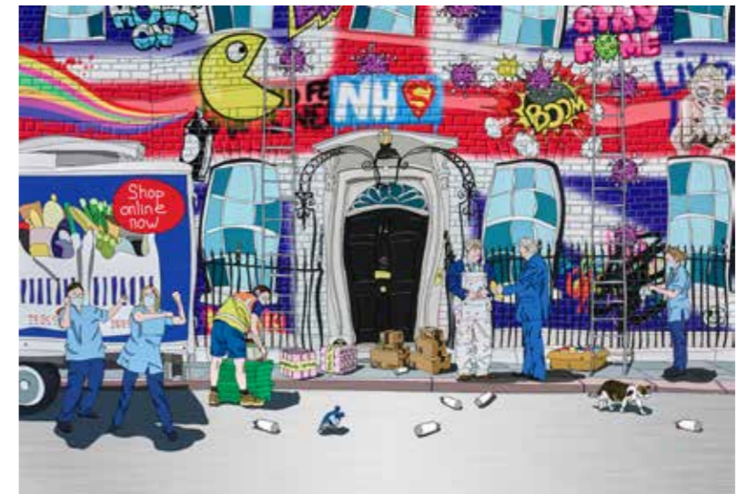
Dylan Izaak Downing Street Aluminium Print Edition of 95 Artwork Size: 28 x 19" Framed Size: 34 x 26" £750

In the world of 21st century art Dylan Izaak is a true original. His whimsical style, vibrant palette and innovative technique have combined to create a body of work which is brimming with colour and personality and is utterly unlike anything else out there. His idiosyncratic view of undulating skylines, famous buildings and busy metropolitan scenes encourages us to look at the world around us with new eyes, and offers a playful contemporary take on urban life.