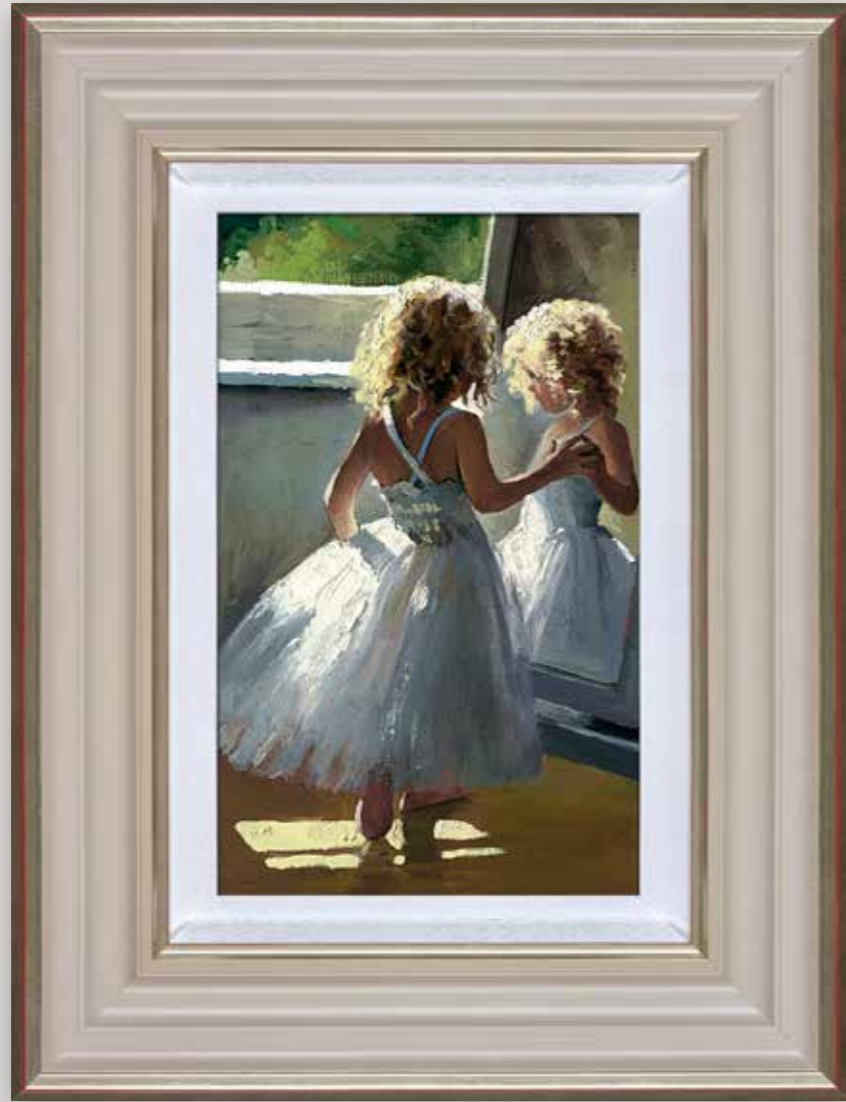
Sherree Valentine-Daines Pretty as a Picture Box Canvas Edition of 195 Artwork Size: 7 x 12" Framed Size: 16 x 21" £395