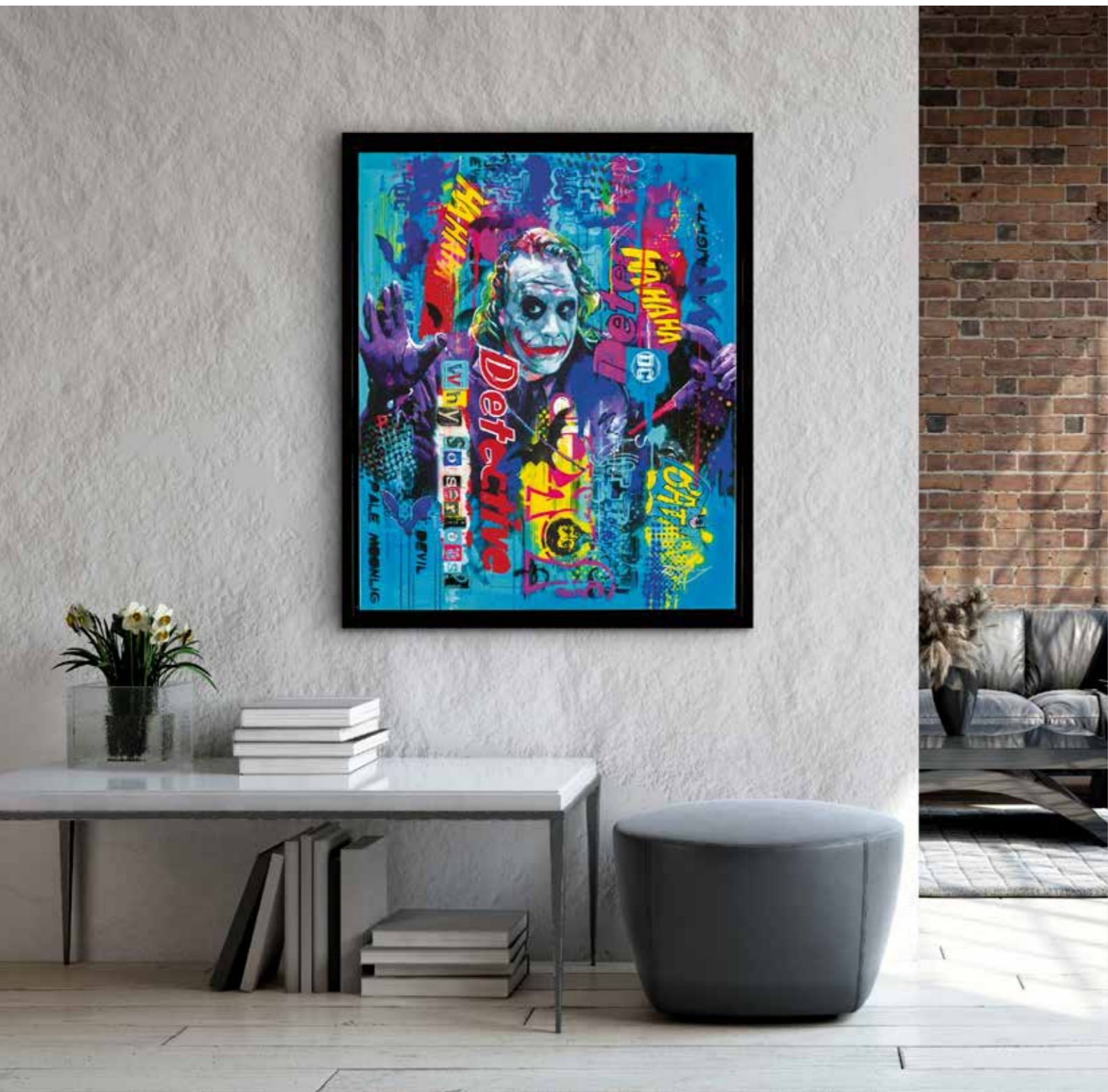
Zinsky Why so Serious? Glazed Paper on Board Edition of 150 Artwork Size: 28 x 31" Framed Size: 33 x 36" £950

THE CAPED CRUSADER MEETS HIS NEMESIS! NEW EMBELLISHED COLLECTOR'S PIECES FROM