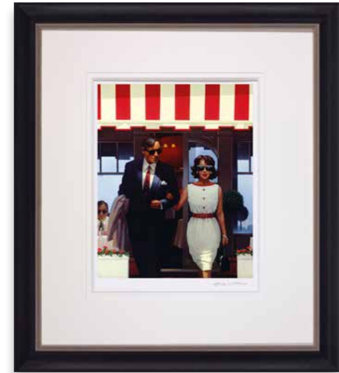
Jack Vettriano Lunchtime Lovers Paper Edition of 125 Artwork Size: 13 x 15" Framed Size: 25 x 27" £575

Jack Vettriano occupies a unique position on the contemporary art scene. Considered by some to be courageous and by others outrageous. With studios in Scotland, London and the south of France, he counts Jack Nicholson, Sir Alex Ferguson, Sir Tim Rice and Robbie Coltrane amongst his collectors.