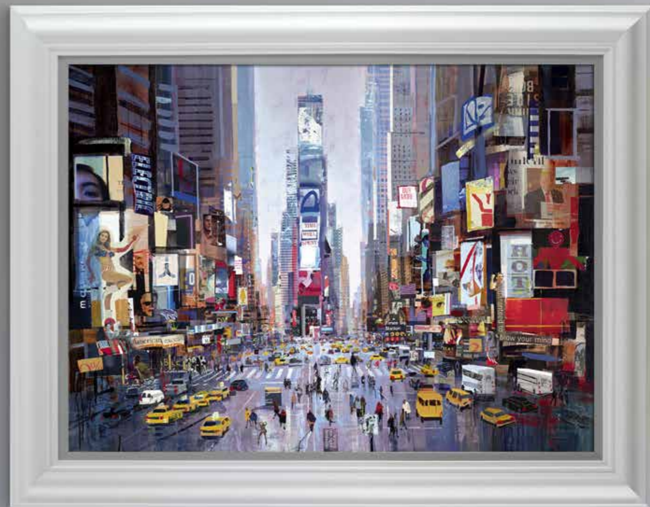
Tom Butler Shine of the Times Paper on Board Edition of 195 Artwork Size: 38 x 28" Framed Size: 47 x 37" £950

His masterly collage interpretations of London show extreme modernity jostling with classic historic buildings and monuments. With his New York scenes however he comments: "The challenge for me is to find new and interesting ways of depicting this great city as so many of its iconic landmarks are very familiar to everyone - so I may go with an unusual colour palette, light condition or more recently with a smattering of humour."